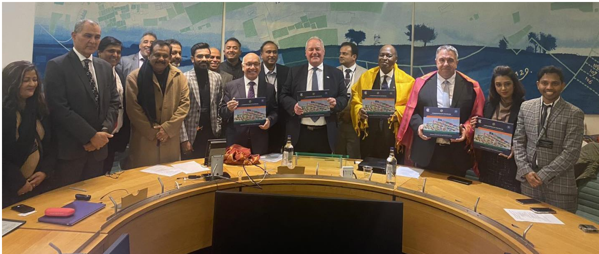
Europe India Centre for Business Industry Panel Discussion