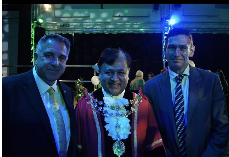
Ruislip High School Presentation Evening

participate in a question-and-answer session. It was also interesting to meet with Learn Hillingdon – Adult Community Education to discuss democracy and the role of parliament.