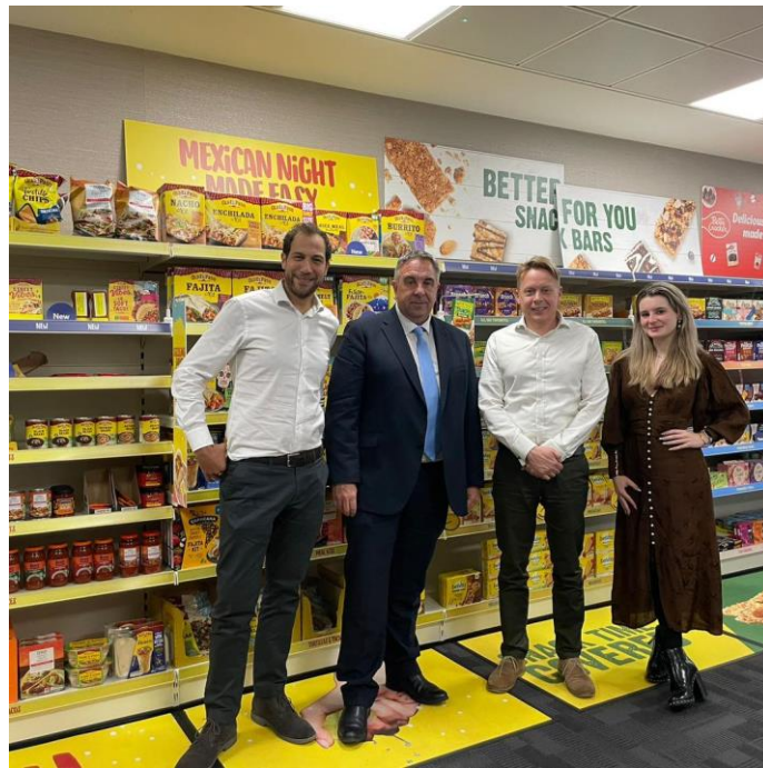
General Mills, Uxbridge