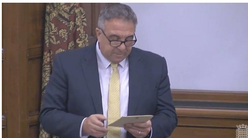
Heritage Pubs speech, Westminster Hall

I delivered my first speech at a Westminster Hall Debate this month, where I expressed the importance of our local heritage pubs and how they do so much for our community, not just by serving us brilliant food and drink but also how they create spaces to laugh and catch up with friends and family. I happily gave a shoutout to our local pubs such as the Crown and Treaty. Within their walls is not just the history of the building, but the history of our community, which is something we can all raise a glass to!