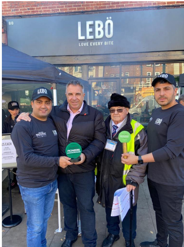
EAT LEBO Team with their award, Ruislip Manor