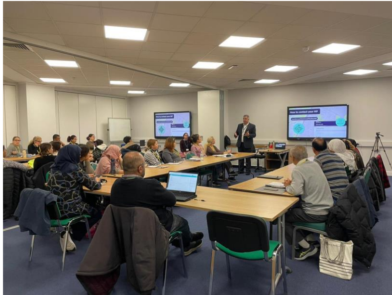
Learn Hillingdon – Adult Community Education

Uxbridge College located in the heart of Uxbridge offers fantastic courses for young adults and I enjoyed watching the students demonstrate the use of technological equipment and see their motor car workshop. We are fortunate to have two university campus' in the constituency and meeting both Chancellors of both Brunel University and Buckinghamshire New University was terrific. Both universities do tremendous work for our healthcare sector, and I know that with the redevelopment of Hillingdon Hospital, we will have an abundance of excellent staff in the future keeping our residents healthy and well.