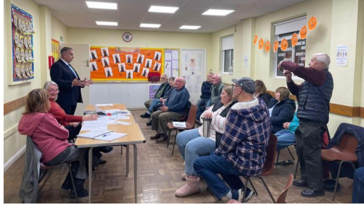
Oak Farm Residents Association

Engaging with constituents is important to me, therefore I enjoyed attending the South Ruislip, Oak Farm and Ruislip Gardens Resident Associations, where I had the opportunity to answer questions and hear about local concerns. A particular highlight for me, whilst attending the Remembrance Day service in Yiewsley, was meeting my dad's friend who used to drop me off to swimming practice during my school years. It was great to meet her and reminisce.