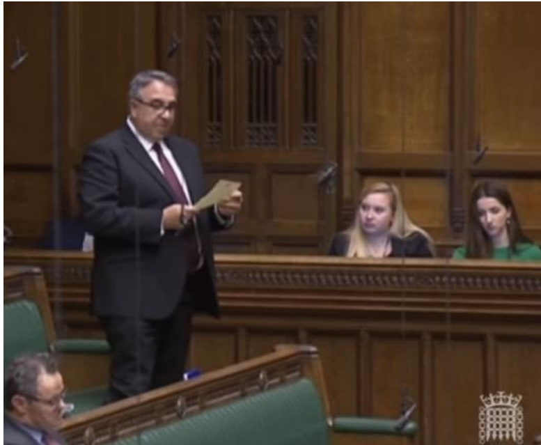
Question to the Home Office Minister, House of Commons Chamber