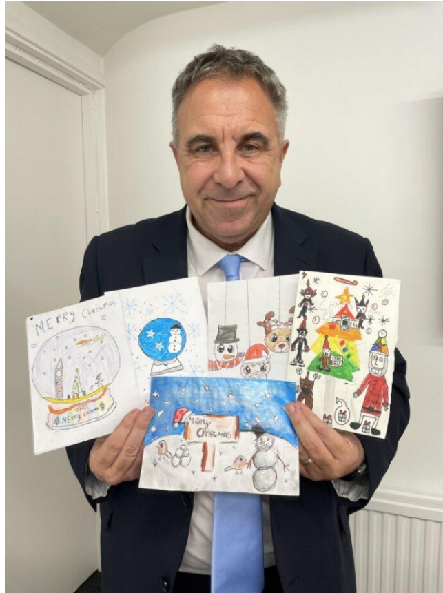
Myself and the Christmas Card Winners

Finally, this month I have been on the TV; on ITV and GB News – talking all things ULEZ! But if you missed me, just look for the videos on my social media.