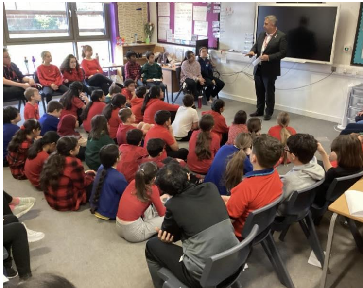
Hermitage Primary School