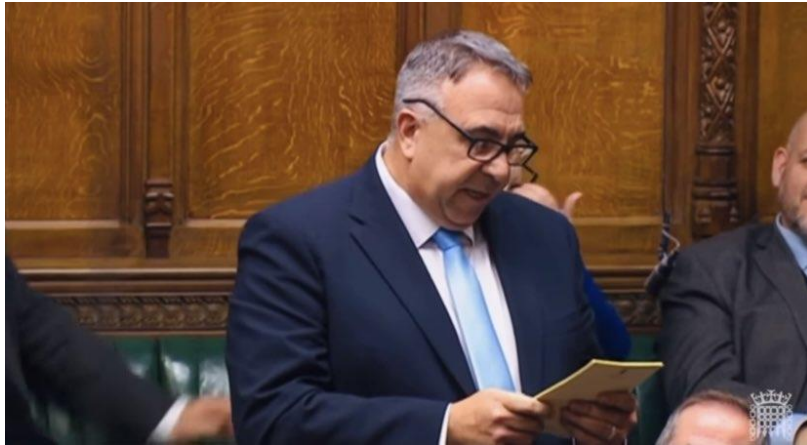
My maiden speech, House of Commons Chamber