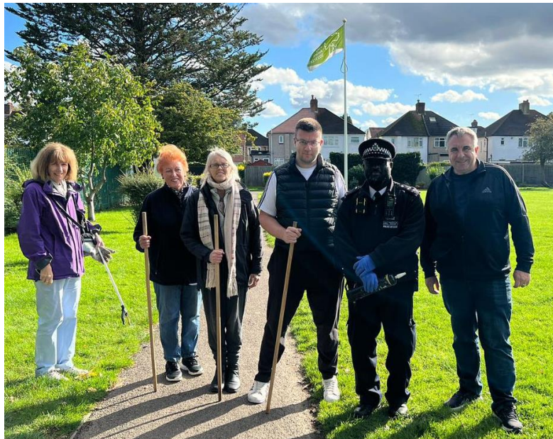
Weapon Sweep with Safer Neighbourhood Team

To mark Interfaith Week , I visited Our Lady of Lourdes & St. Michael Catholic Church, the Adhya Shakti Mataji Temple, the Ruislip Manor Synagogue and in October, I visited Cowley Mosque. I keep in close contact with faith leaders and religious communities in Uxbridge and South Ruislip; whether I drop-in to say hello, or give them a call, it is important to me that they feel safe and comfortable to practice their religion and that they know that I am here if they need any support.