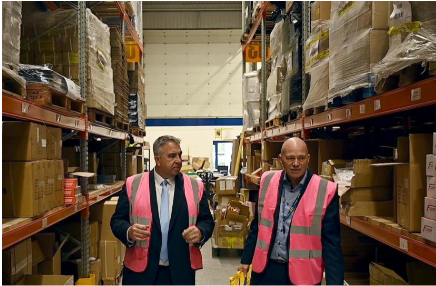
Mills Ltd, Cowley