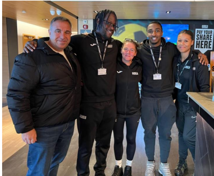
GOALS Soccer Team

In terms of my commitment to children with Special Educational Needs & Disability (SEND), and during Disability History Month, I attended Wealdstone FC's SEND Football Trials where I spoke to families who are really benefiting from the brilliant work of our local football club to ensure that each child, irrespective of their disability, is included and is given the best possible chance to showcase and improve their skills. Moreover, my visit to Moorcroft School was informative to learn about the sight testing provision that SeeAbility provide to children with SEND, but also it was delightful to meet the young people and have a tour of the school.